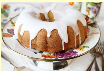
Hawaiian Pineapple Cake