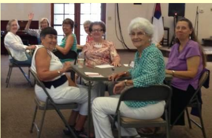
Having Fun Playing Bunco in 2013