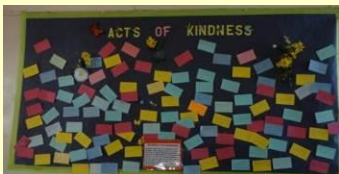
Acts of Kindness Bulletin Board